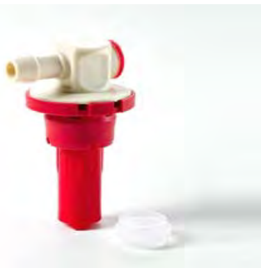
INJ-TL1 Terminating Water Injector, for Standard Bayonet Vent Openings