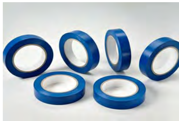
INJ-202 Tape, installation, 36 yd, (6 pack)