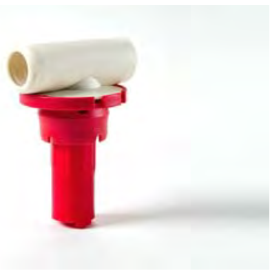
INJ-L1 Water Injector, for Standard Bayonet Vent Openings