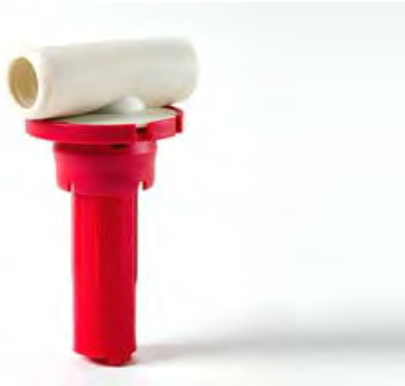
INJ-L1A Water Injector, Extended Downtube, for Standard Bayonet Vent Openings