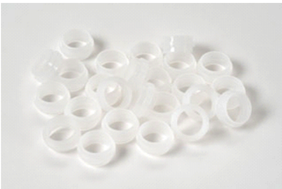
INJ-608 Collars for Water Injectors & Stealth Systems (25 Pack)