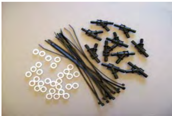
INJ-615 Wye Fitting with collars (10 Pack)