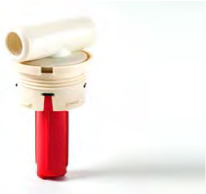
INJ-L1AD Water Injector, Extended Downtube, for DIN Vent Openings