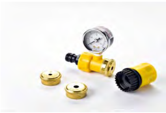
INJ-FC Flow Checker, for testing output pressure compatibility