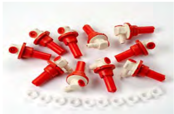
INJ-TL10 Terminating Injector, 10 pack, with collars