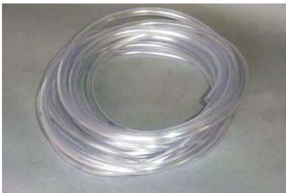
INJ-198 Tubing, 25 feet 1/2" OD