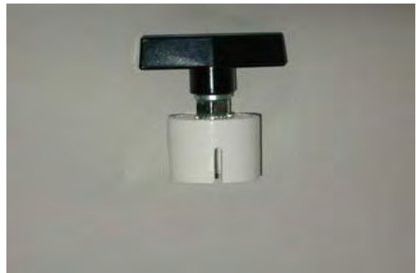
INJ-RWR Quarter Turn Wrench for Raised Adapters