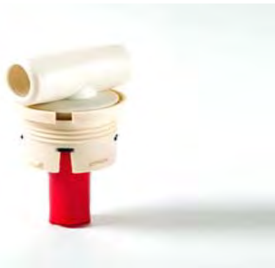
INJ-L1D Water Injector, for DIN Vent Openings